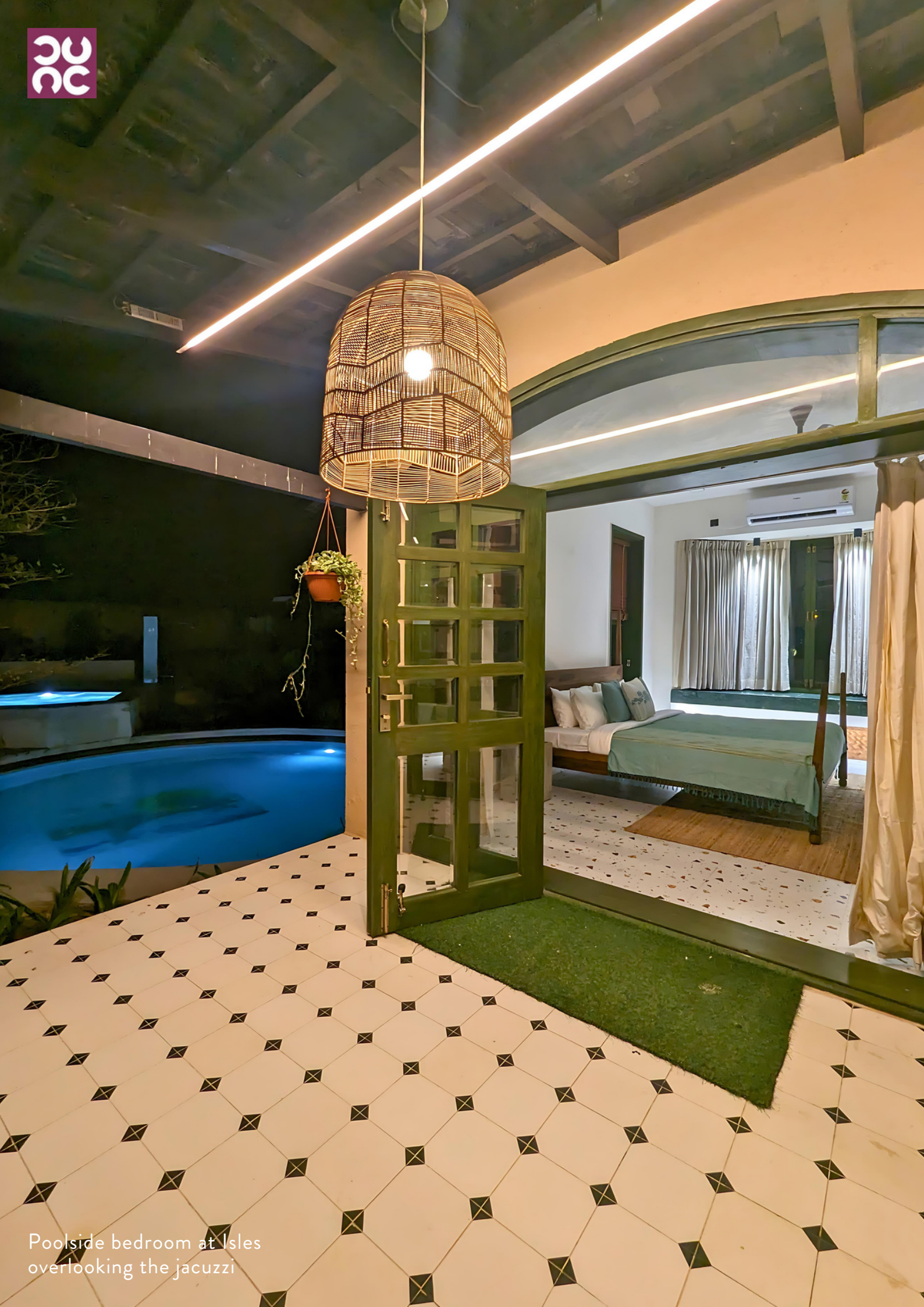
Poolside bedroom at Isles overlooking the jacuzzi