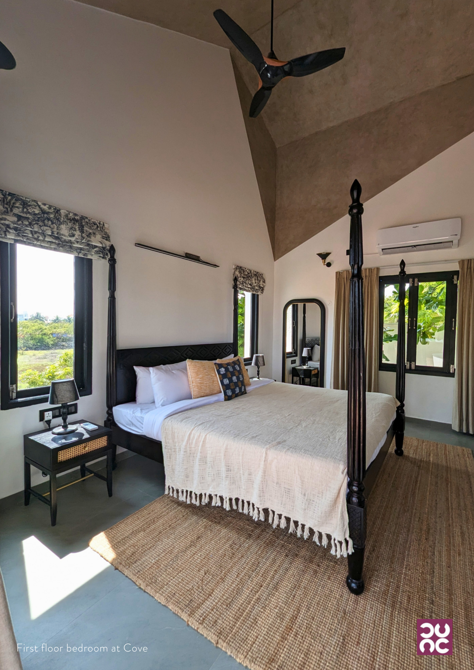
First floor bedroom at Cove