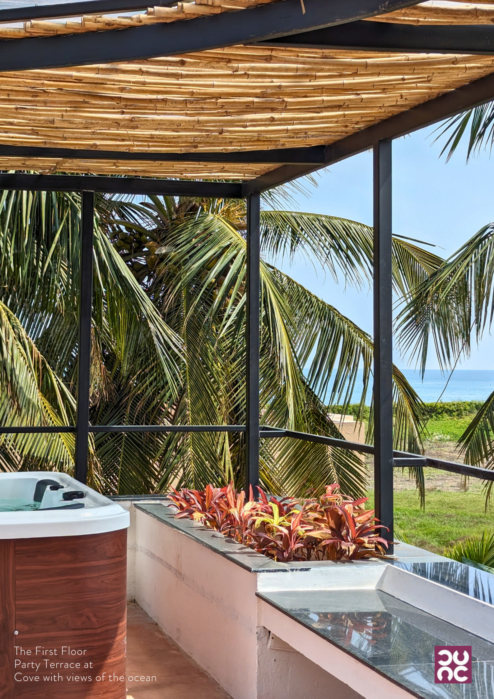
The First Floor Party Terrace at Cove with views of the ocean