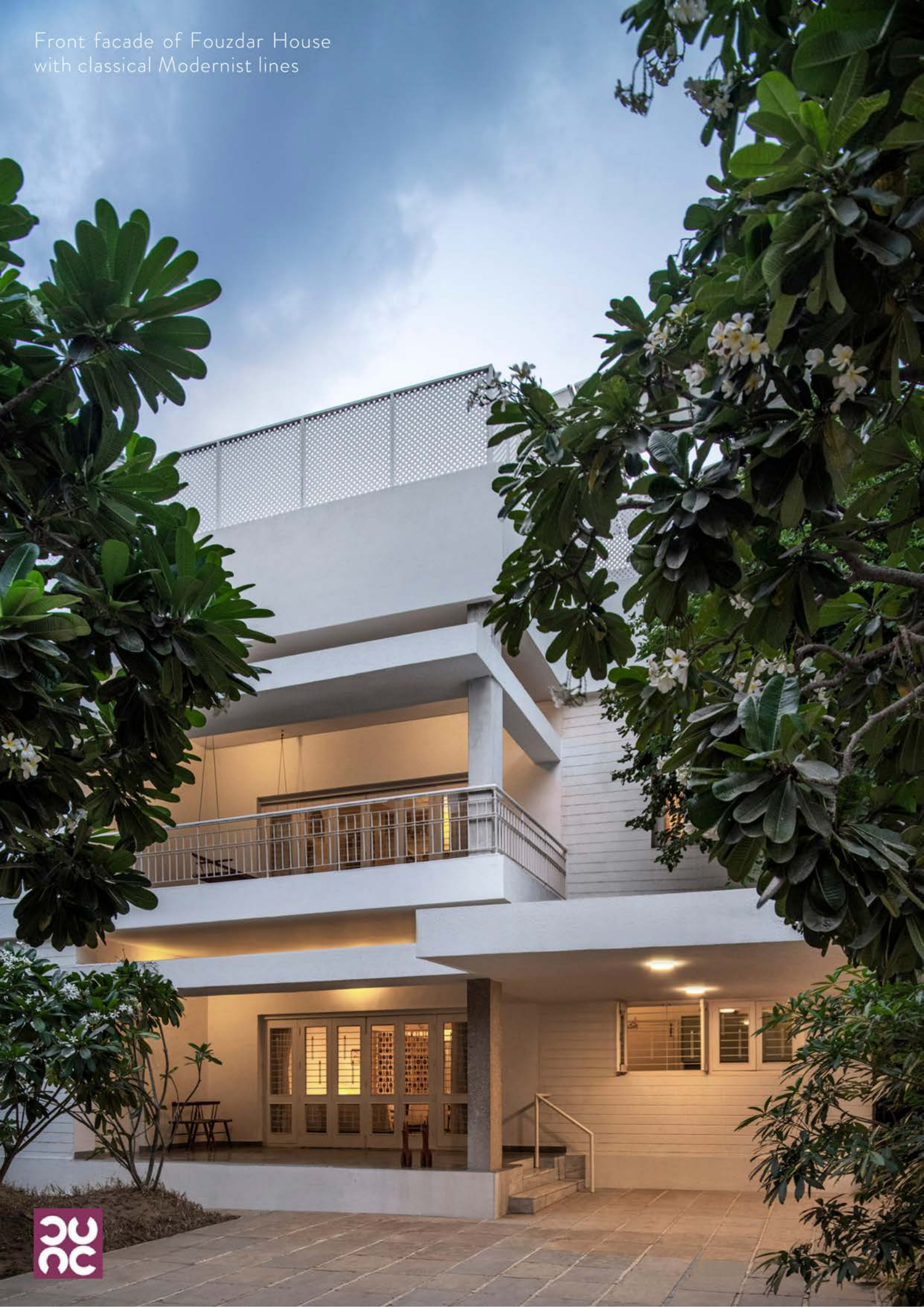
Front facade of Fouzdar House with classical Modernist lines