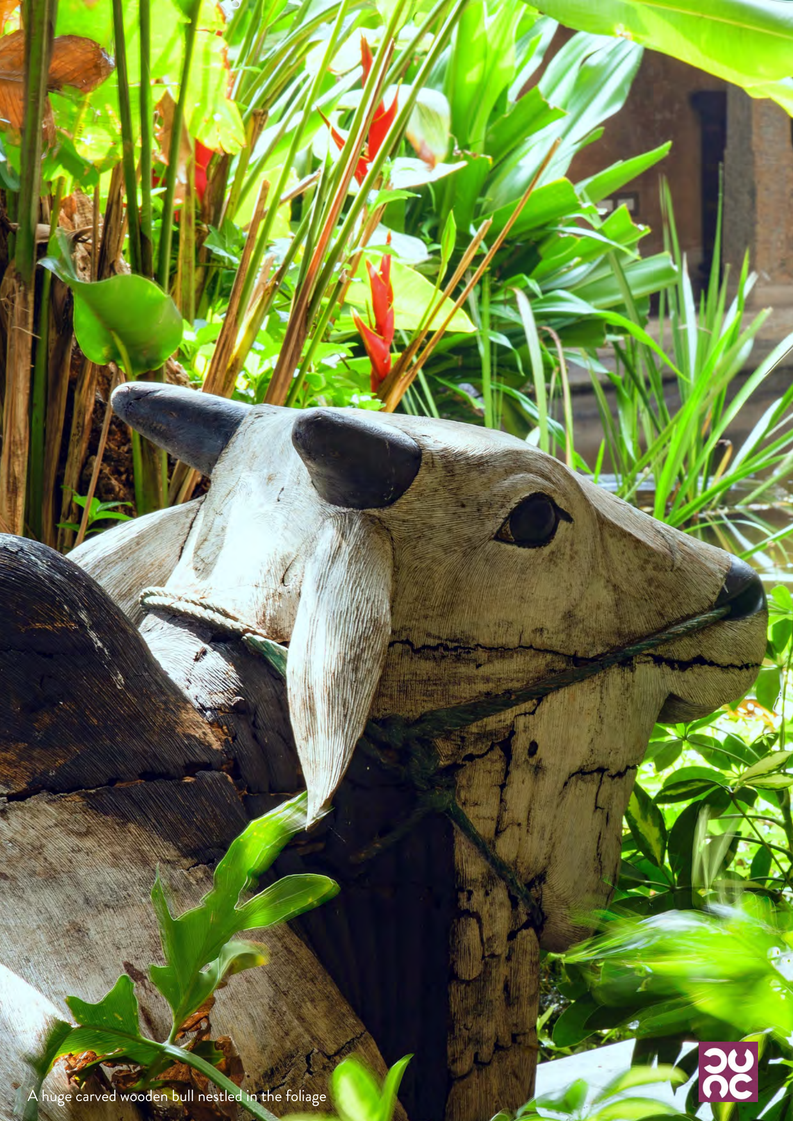
A huge carved wooden bull nestled in the foliage