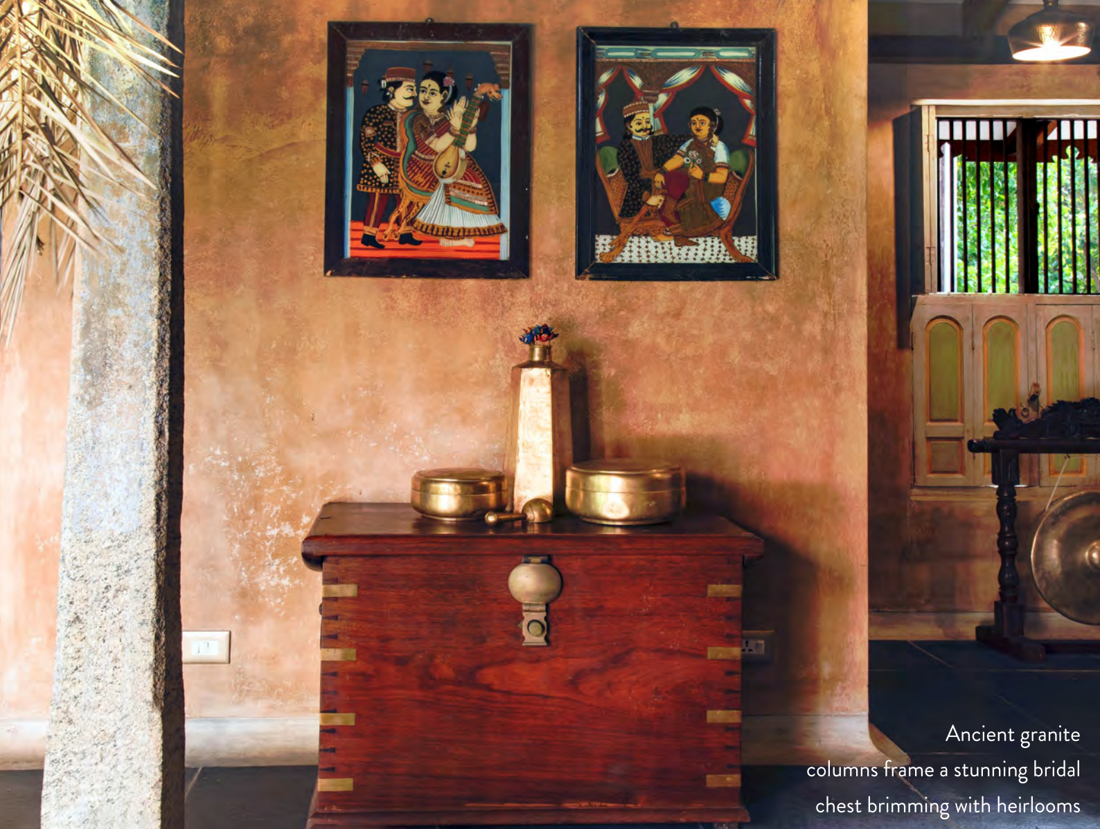
Ancient granite columns frame a stunning bridal chest brimming with heirlooms