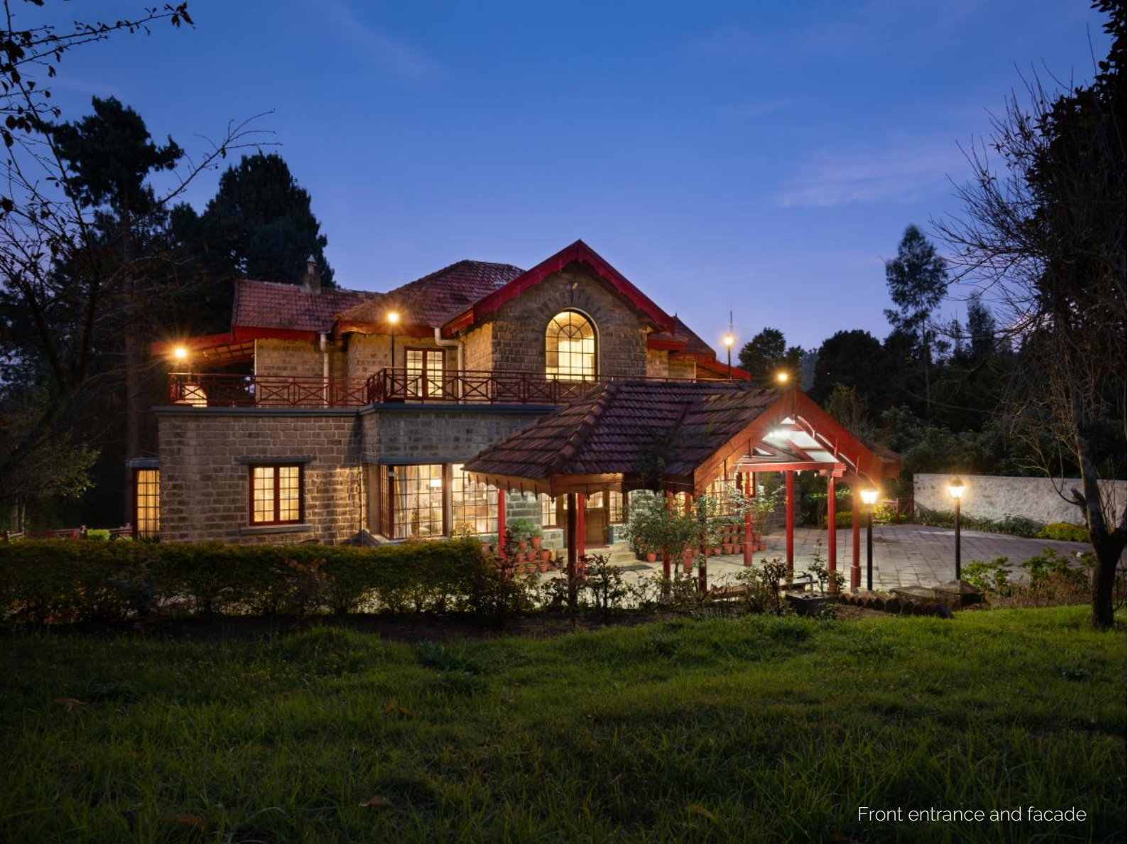
Front entrance and facade