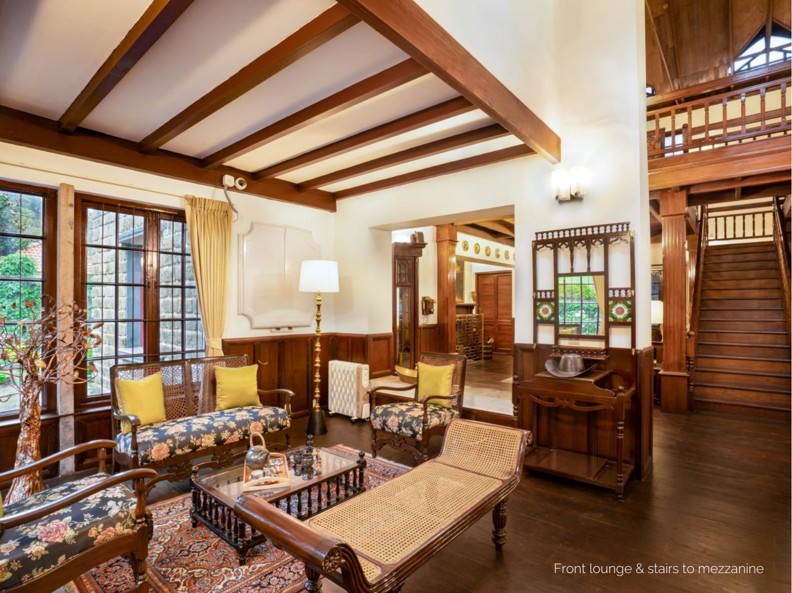
Front lounge & stairs to mezzanine