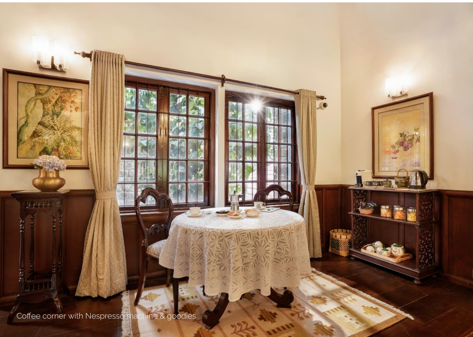
Coffee corner with Nespresso machine & goodies