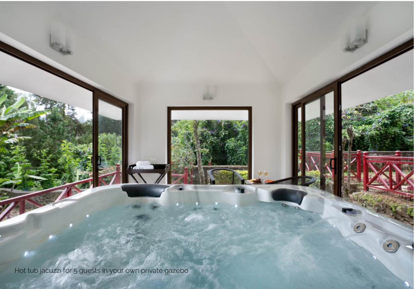
Hot tub jacuzzi for 5 guests in your own private gazebo