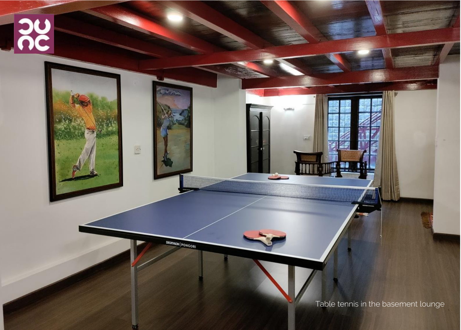
Table tennis in the basement lounge