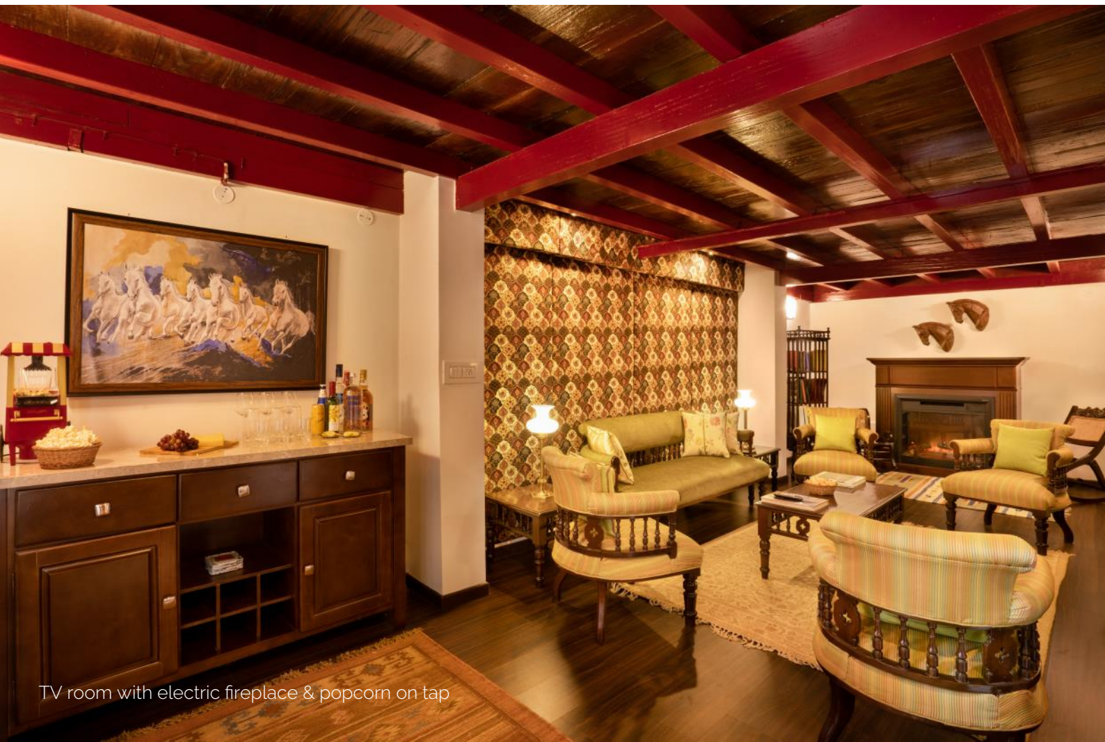
TV room with electric fireplace & popcorn on tap