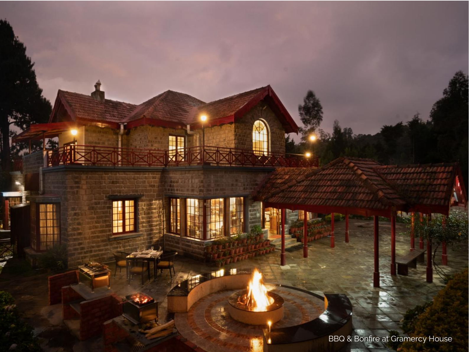
BBQ & Bonfire at Gramercy House